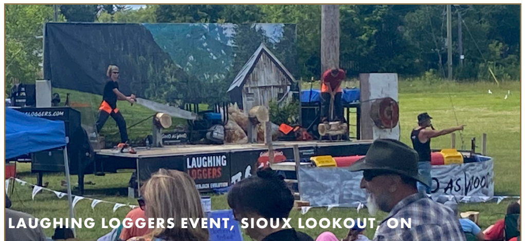
LAUGHING LOGGERS EVENT, SIOUX LOOKOUT ON