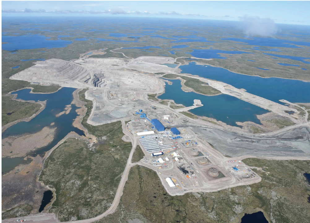
Gahcho Kué Mine, De Beers Canada 2019

A question First Mining Gold is frequently asked, why is the Springpole Project proposed as an open pit mine; why is an underground mine not an option?